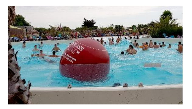
5. Wow Wave Ball Pool