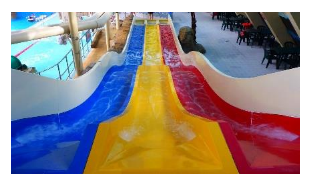
2. Racer Slides