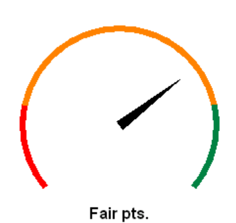
Adult Services and Health -Quarterly Indicators (Overall Indicator Performance, Q3 07/08)