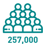
Population of Derby

These actions are underpinned by our core values which, put simply, reinforce that the Council, its councillors and officers are here for Derby.