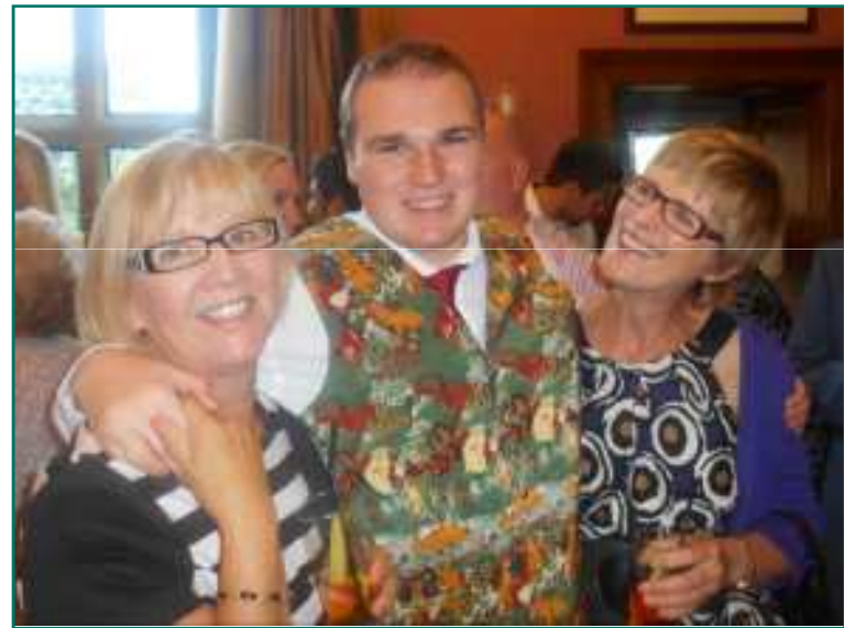
Transition2 2014 www.transition2.co.uk

More people will be supported by a network of family, friends and people in their community