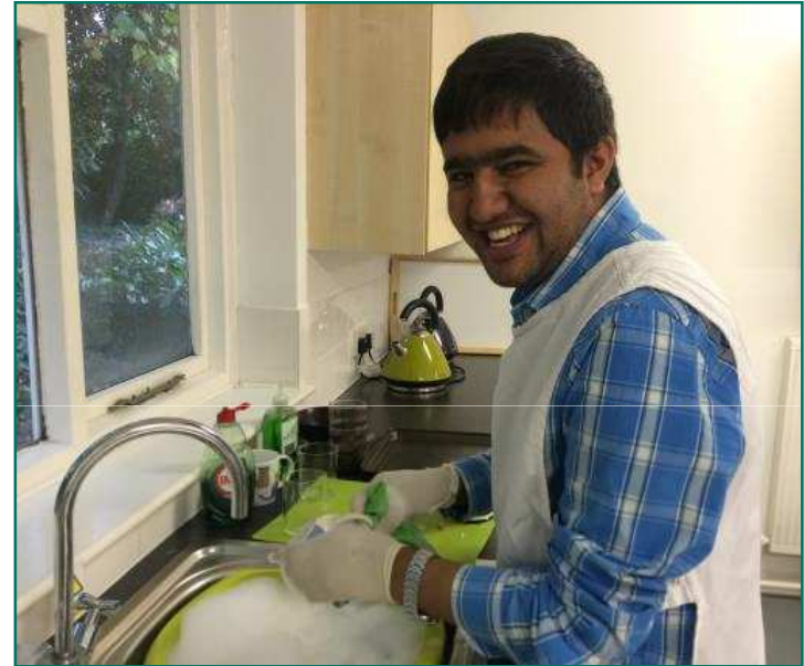
Transition2 2014 www.transition2.co.uk

More carers will be supported through an Emergency Plan