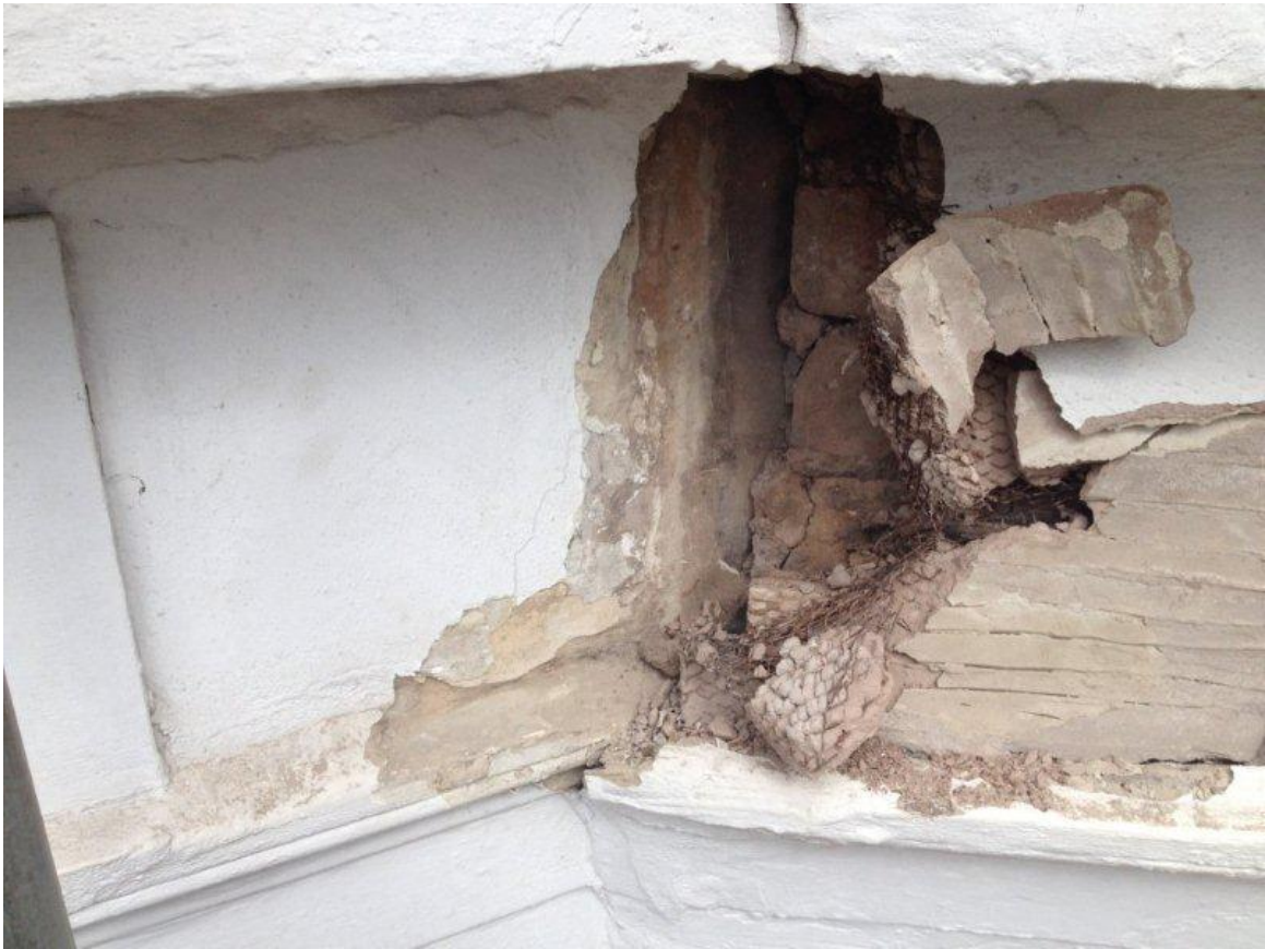
Modern Repair to clay element above at junction with stone of original portico and failing below