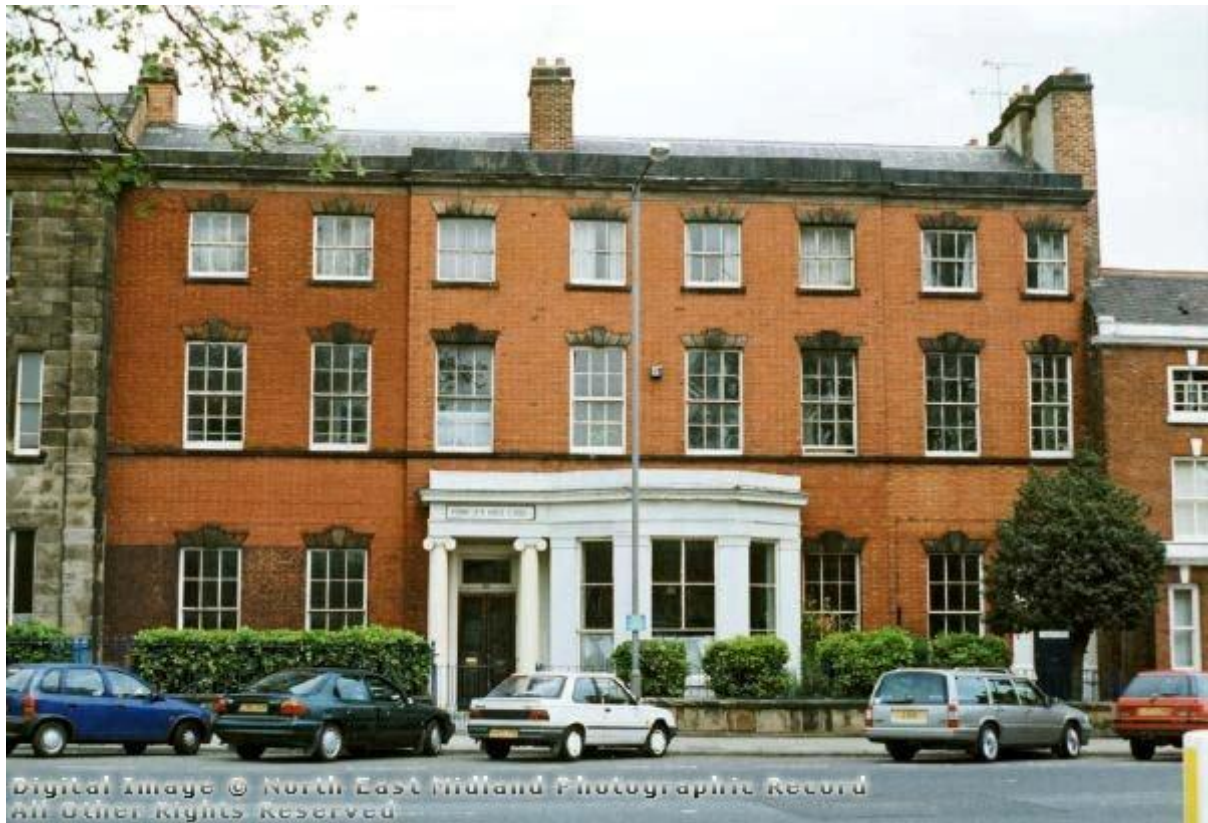
Friar Gate House Pre and Post cleaning. Fine stonework can now be appreciated.