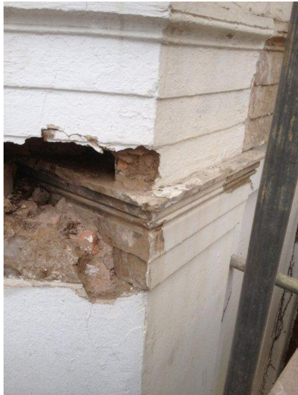
Top left Cleaned columns and portico exposing high quality stonework Top right exposed stone column behind bay Below exposed bricks not attached to original Georgian Stonework to rear