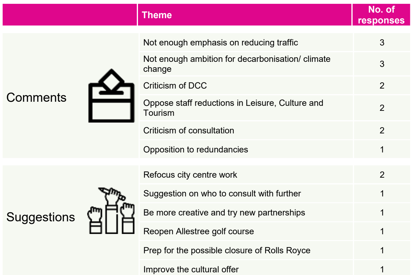
Figure 3: General comments and suggestions (themes)

Consultees were also given the opportunity to give feedback or suggestions on the budget and recovery plan as a whole – 18 responded, some commenting on multiple parts of the consultation. Comments and suggestions touched on a number of themes. The most common related to the plans not being ambitious enough with regard to decarbonisation, the environment and reduction of traffic across the city.