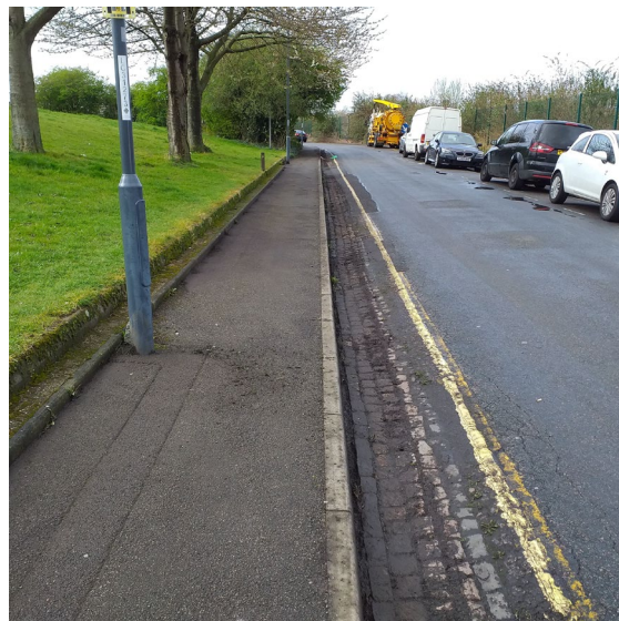
Russell Street After