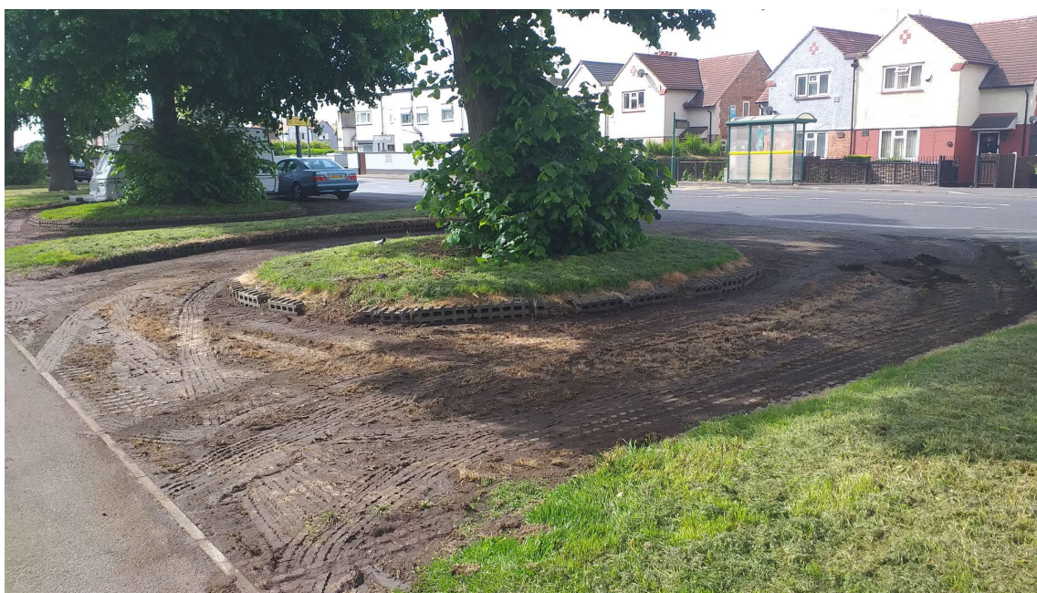
Osmaston Road Parking Areas After