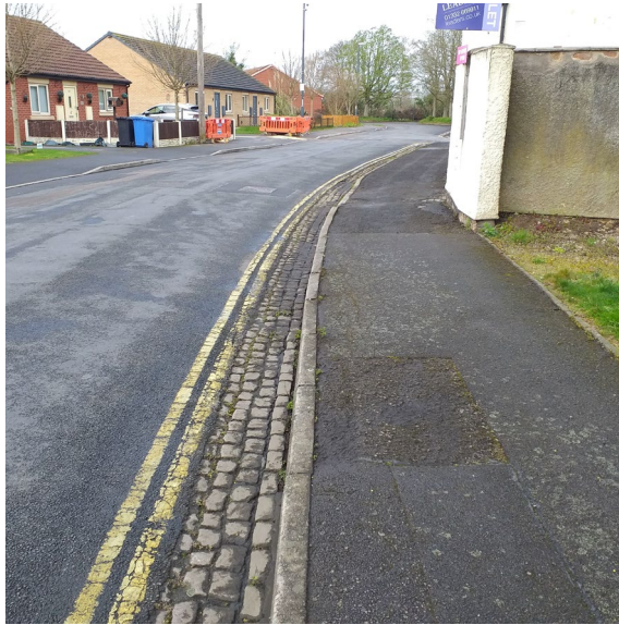
Cotton Lane After