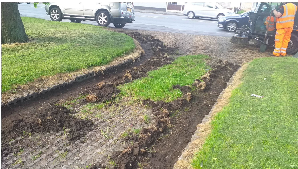
Osmaston Road Parking Areas Before