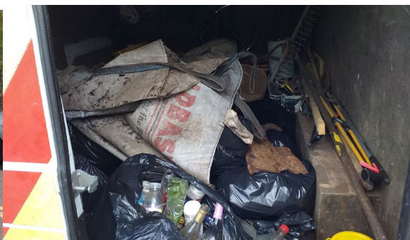
GBSC 2022 Van full of Collected Rubbish