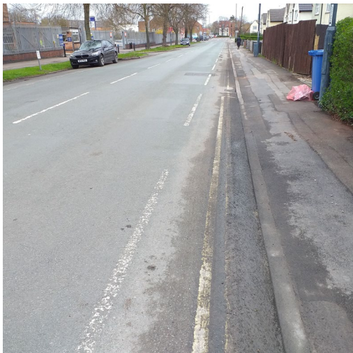
Elton Road After