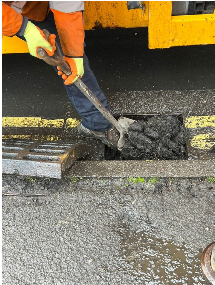
Cotton Lane Blocked Gully