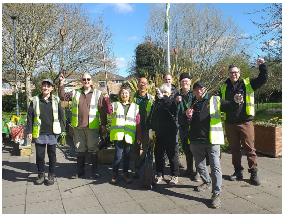
GBSC 2022 Litter Pick Before