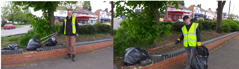
Wordsworth Avenue Area

Photos below of some of the recent litter picks we have carried out: