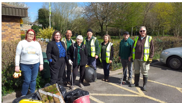
GBSC 2022 Litter Pick After