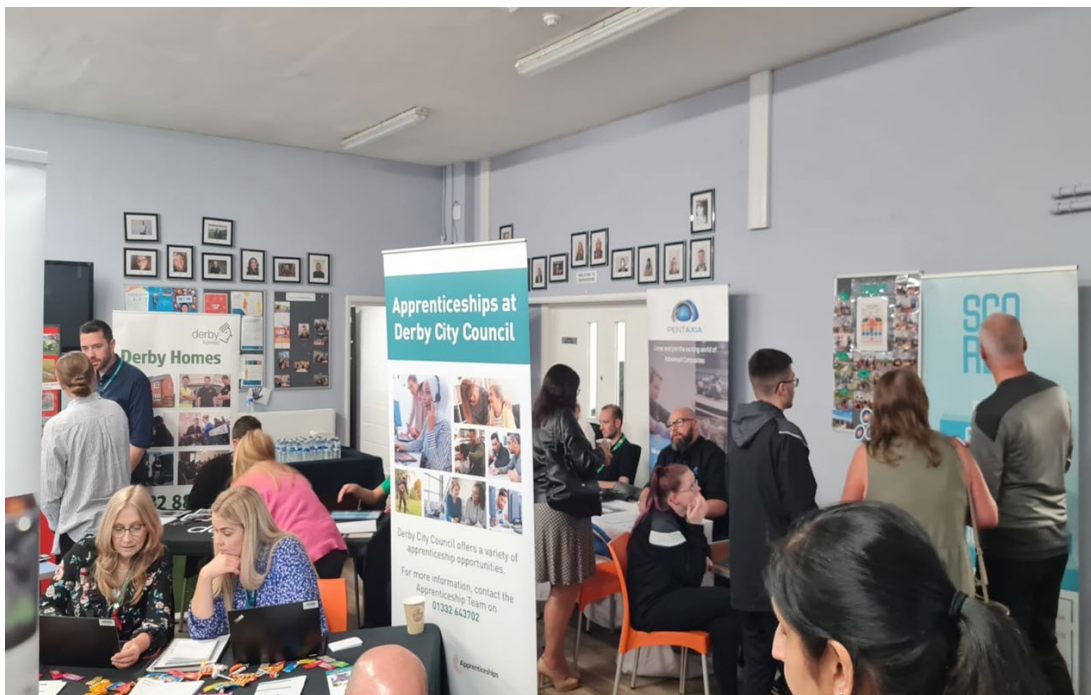
Really positive event

This just demonstrates the power of #BetterTogether