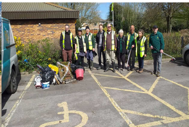
GBSC 2022 Litter Pick After