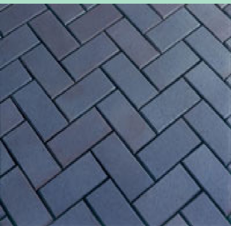
Ketley blue pavers