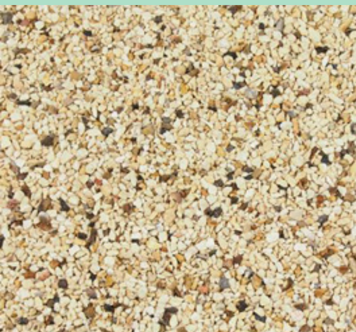
Buff coloured resin bonded gravel