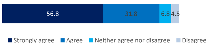
Chart 1 - Extent of agreement with the overall strategy (%)

4.5% (2 respondents) disagreed that the proposals would help to bring homes back into use.