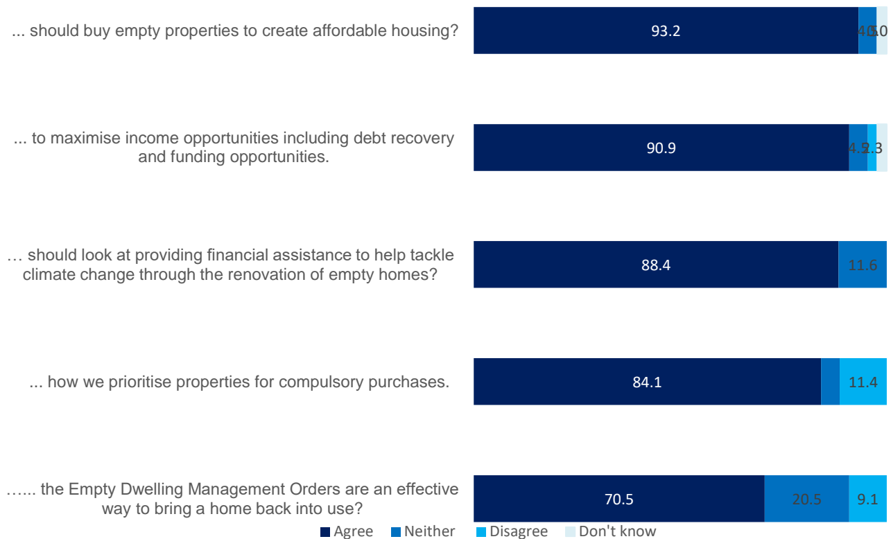
Chart 2 - extent of agreement with the strategic objectives (%)